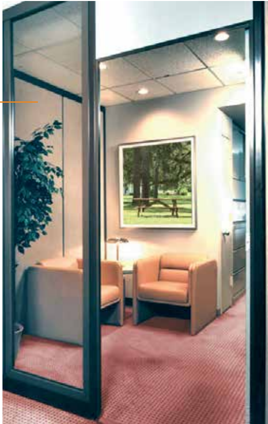
Executive management full glass.