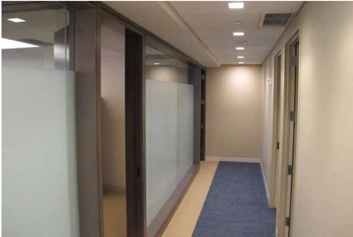
Architectural walls that embody style and durability.