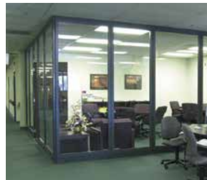
Half glass door with louver and half glass walls.